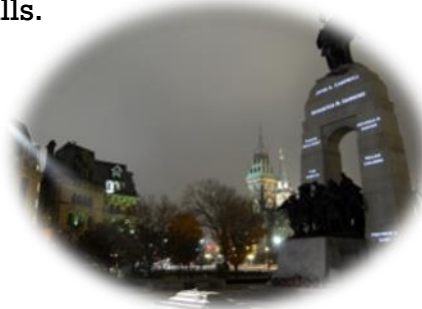
Photo: City of Ottawa Archives, CA-001244 , Information t– National War Memorial taken from— https://www.tpsgc-pwgsc.gc.ca/biens-property/galerie-gallery-eng.html Canadian Heritage exhibit: The National War Memorial-Symbol of Remembrance

Remembering in new ways Canadians continue to experience the National War Memorial in new ways. In the week leading up to Remembrance Day 2008, actor R.H. Thomson and lighting designer Martin Conboy orchestrated a unique commemoration, with the names of the 68,000 Canadians who died in the First World War being projected on the Memorial's granite walls.