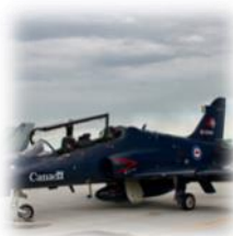
RCAF Hawk Trainer