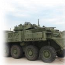
Canadian Army LAV Armoured vehicle