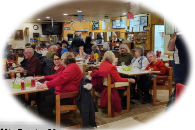
Volunteer & Staff Christmas Party