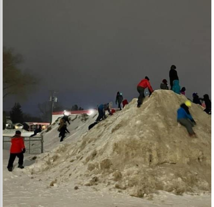
The Navy League cadets climbing the snow mountain just north of their Legion home.