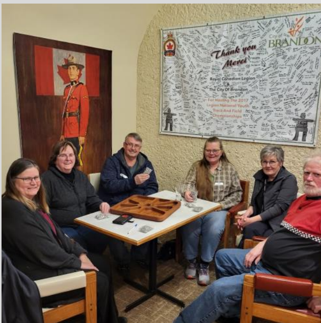
Members sharing a friendly game after an early afternoon 'Legion Meat Draw'.