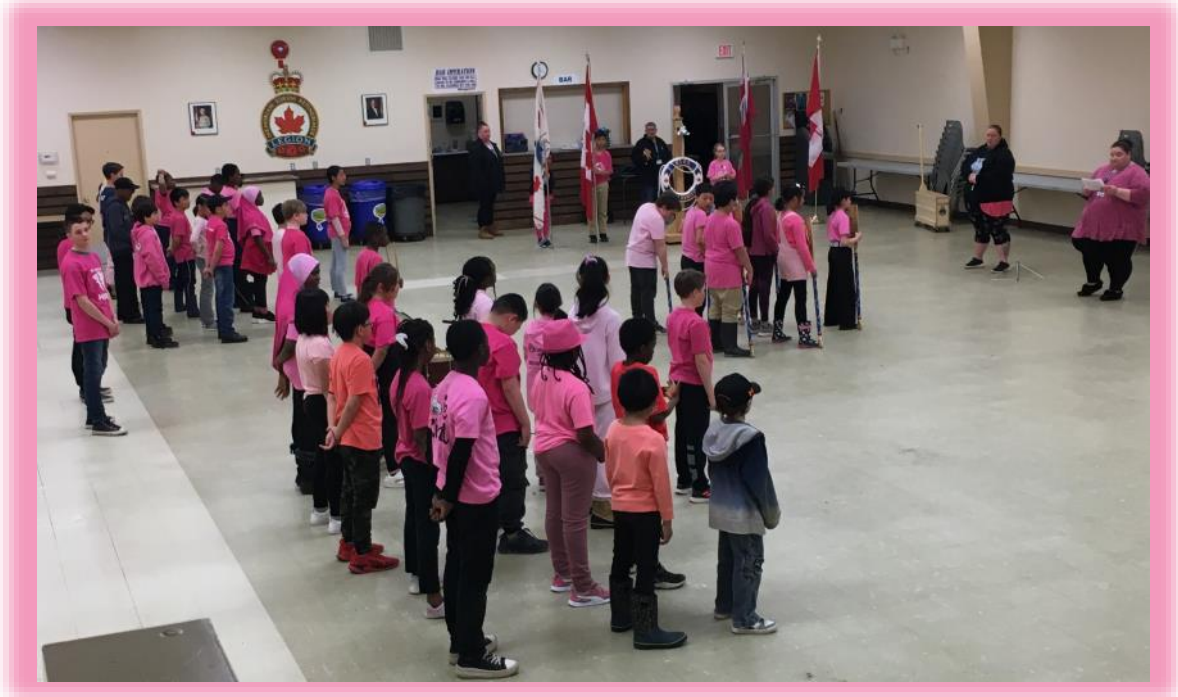
On April 12, 2023 Stan Hawitt Navy League Cadets participated in an “Anti Bullying “ themed class by wearing pink

Our 2023 Pink Shirt Day design was inspired by moments of kindness, empathy and understanding that can mean so much to children impacted by bullying. For bullied kids, it can be hard to know where to turn. But a helping and supportive hand can make a world of difference! Remember that whether it's sending a check-in text, calling out bullying behaviour when you see it, or simply offering your support, there are so many ways we can all help and connect with people being bullied. Let's Lift Each Other Up this Pink Shirt Day, and all year round!