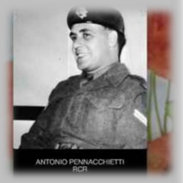
Visit the Virtual Wall