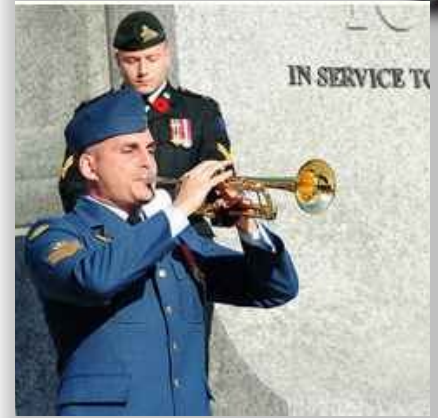
Learn about the Two Minutes of Silence