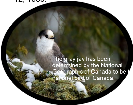
The gray jay has been determined by the National Geographic of Canada to be the national bird of Canada.

The park can be found at the exact longitudinal (east-west) center of Canada. Sitting at 96^{\circ} 48' 35'' W, this spot is situated in the town of Tache, Manitoba, which is just 30 minutes from Winnipeg.