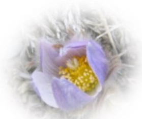
The official flower of Manitoba is the Prairie Crocus, which was adopted in 1906